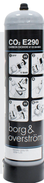
E290 CO 2 Cylinder - 1200g